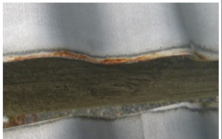
Friction-cut Edge – 12 months severe marine